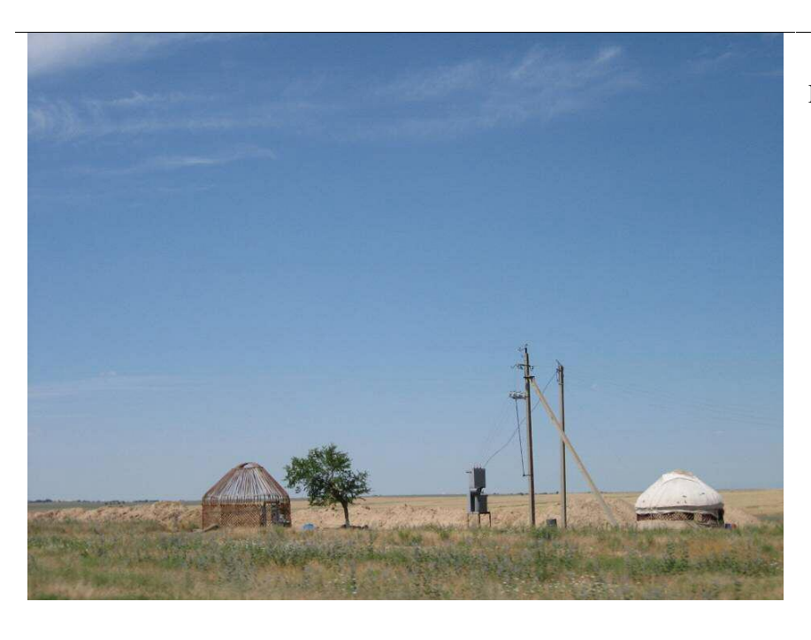
Figure 2: Typical landscape on the roadside between Shymkent and Turkistan, with Yurts in the foreground and large corn fields in the back. The yurts serve as temporary quarters for agricultural workers and are well (50-100 m) outside the ROW.

Small villages and settlements along the road are fairly frequent (every 5-10 km)