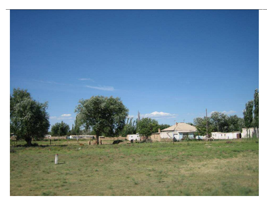
Figure 5: Typical village along M32, the houses being set back a distance from the road (about 100-150 m) with a bet of trees and grass sheltering the village from the road.