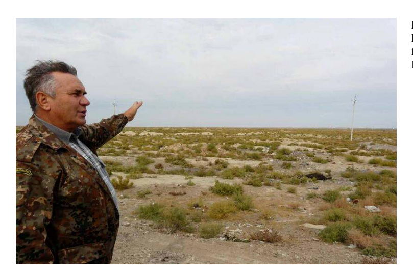
Photo 0-1 View across typical arid lands near Kyzylorda showing the future alignment of the Kzylorda Bypass.