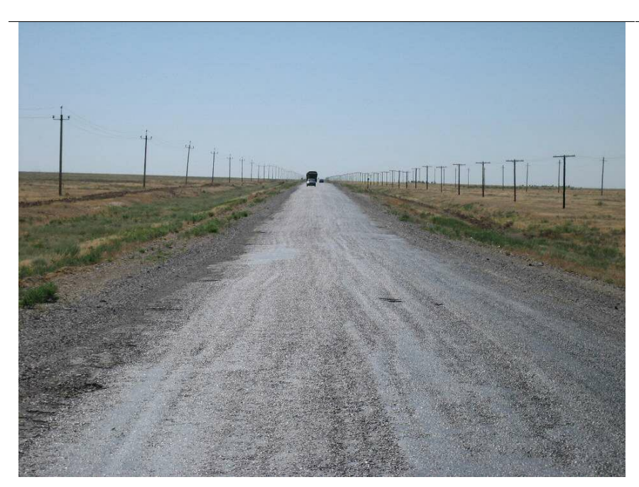
Figure 7: Typical road section just South of the Kyzylorda Oblast boundary. Due to the arid climate shelter belt vegetation is absent.

Notably, the road corridor is combined with other infrastructure, in this case parallel running power lines.