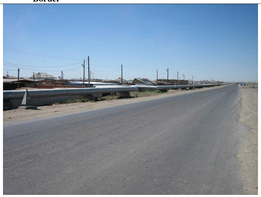
Figure 8: Route M32 on the outskirts of Kyzylorda City, traversing mixed residential, commercial and industrial areas.