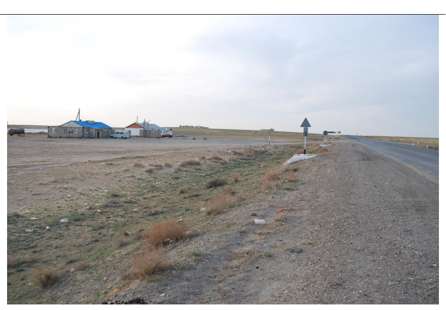
Figure 12: Typical roadside station near Aralsk. The structures are well removed from the ROW and will not be affected by construction works.

The surrounding landscape has little productive value and becomes progressively arid around the Aral sea and N towards the Aktobe Oblast boundary. Photo taken near Baikonur.