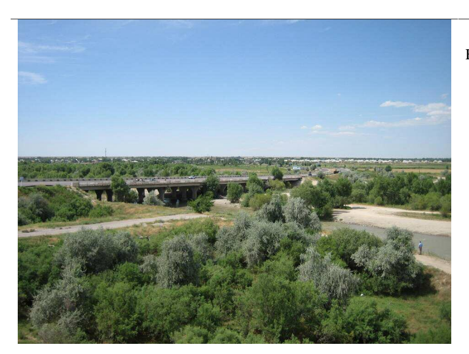
Figure 3: Crossing of Arys river at Temirlanovka village. Bypasses options are being investigated and designed on either side of the village.