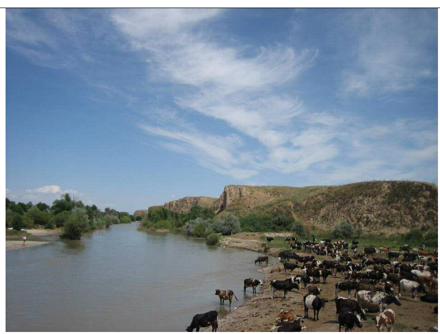
Figure 4: Detail from Arys river crossing, view to SE (upstream).