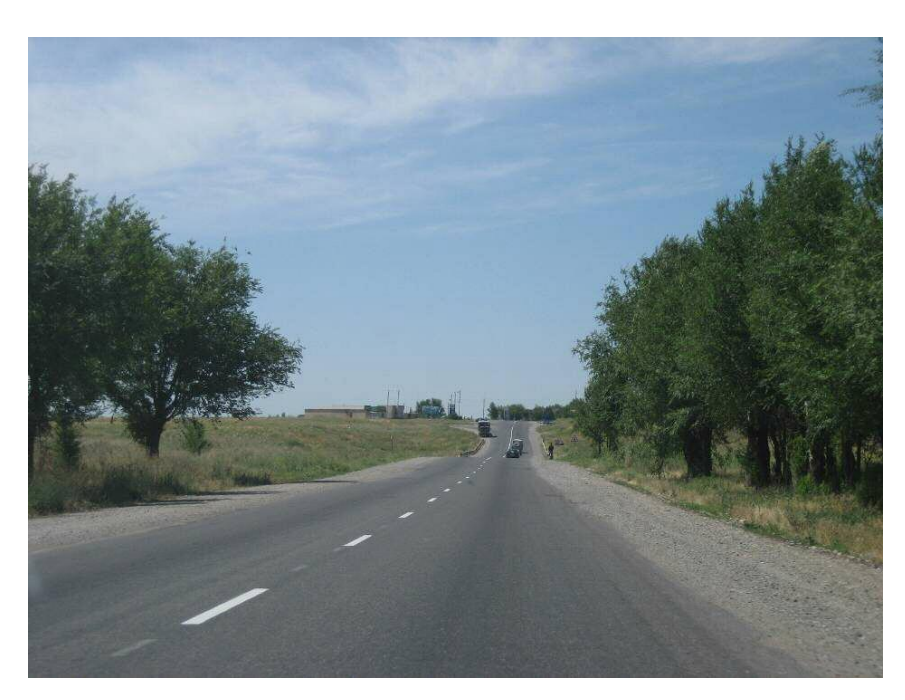
Figure 1: Typical road section N of Shymkent city. The ROW is planted with a shelter belt of tall trees, which is more or less continuous with occasional breeches. The adjacent countryside is used agriculturally (without irrigation) and for extensive livestock grazing.

Small villages and settlements along the road are fairly frequent (every 5-10 km)