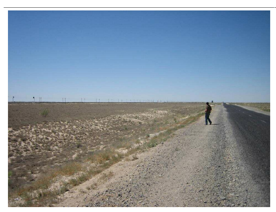
Figure 11: Over long distances M32 as well as the railway, power lines and pipelines run parallel to each other, thus forming a wider "infrastructure corridor".

The surrounding landscape has little productive value and becomes progressively arid around the Aral sea and N towards the Aktobe Oblast boundary. Photo taken near Baikonur.