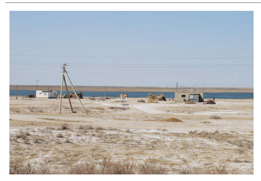
Figure 9: Typical small village between Kyzylorda and Aralsk.