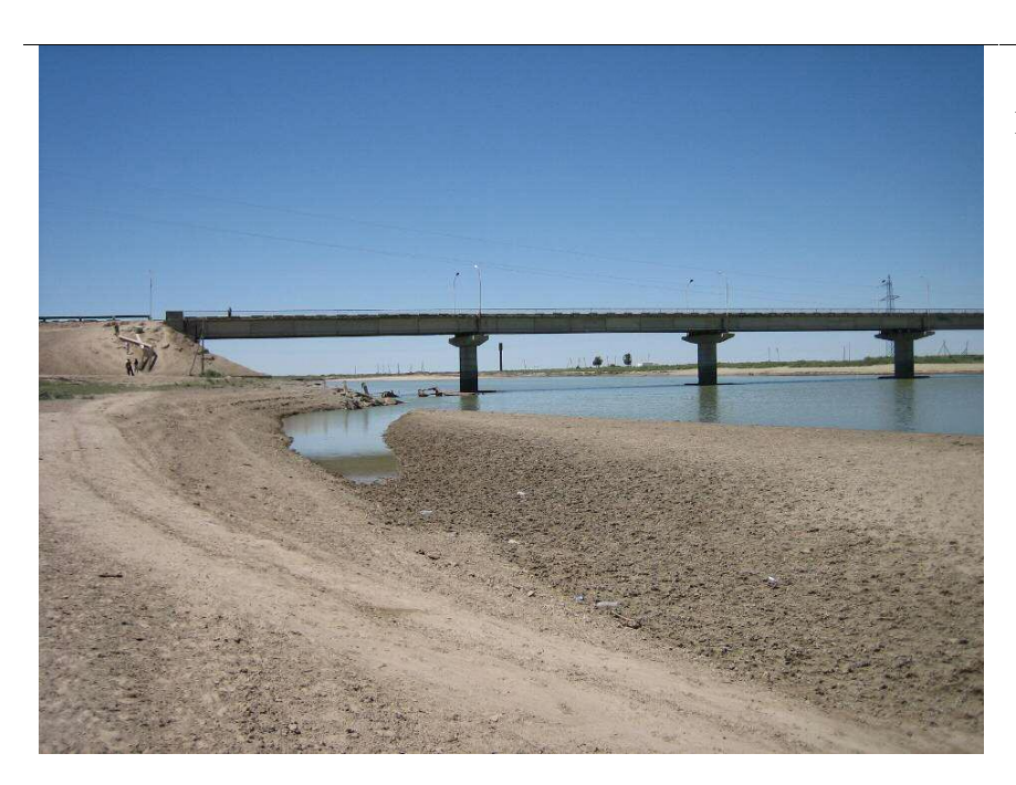
Figure 10: Second Syrdarya crossing at the town Jozhaly.