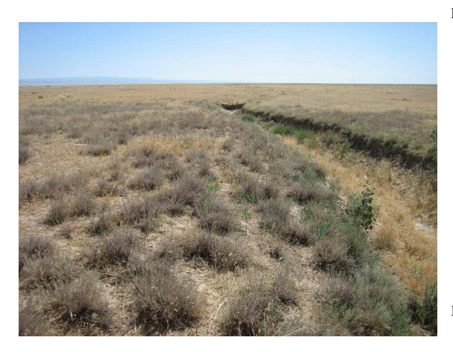
Figure 6: Near the boundary between South Kazakhstan and Kyzylorda Oblasts the vegetation reflects the progressively arid climate. During a few weeks per year (usually in spring) snowmelt and rains can cause high surface runoff, resulting in a distinct drainage pattern.